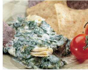
SPINACH ARTICHOKE DIP