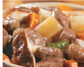
WILD MUSHROOM BEEF STEW