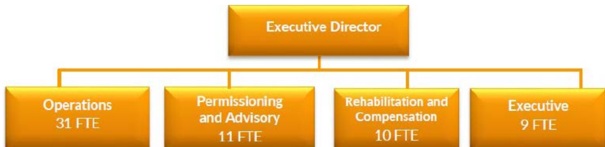
Figure 1 – NT WorkSafe Organisational Figure 3

During 2017-18 and 2016-17, the Work Health Authority was provided with 62 full-time equivalent staff (FTE) as per the Figure below.